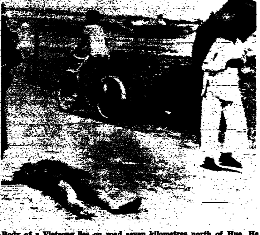
Body of a Vietcong lies on road seven kilometres north of Hue. He was killed during an attack on a South Vietnamese outpost guarding Route 1, main supply route for South Vietnamese troops guarding the northern border.

SAIGON (AP). — Thousands of tank-led North Vietnamese troops renewed assaults yesterday on two towns below the Demilitarized Zone and north of Saigon in a drive to crush the South Vietnamese army and seize provincial capitals and district towns.